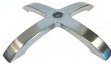
(B) Base X1