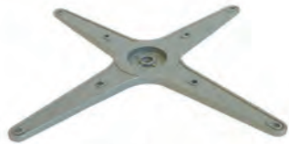
(A) Spider X1