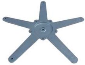
(A) Spider X1