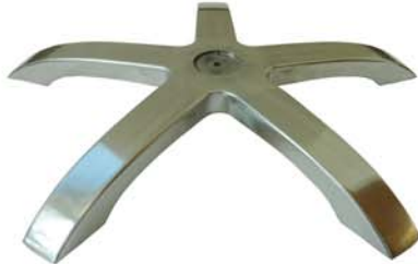
(B) Base X1