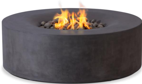
Charcoal Grey shown above AV-CH-NG/LP