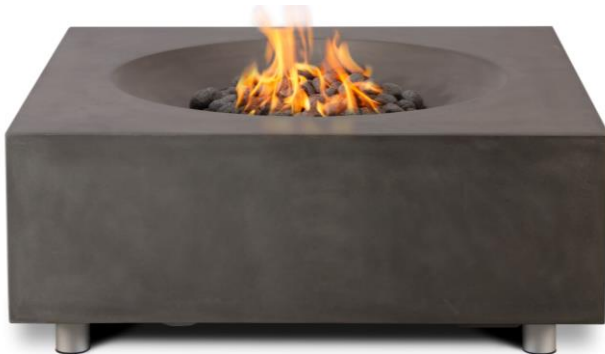
Slate Grey shown above with Optional Aluminum Legs TA-SL-NG/LP