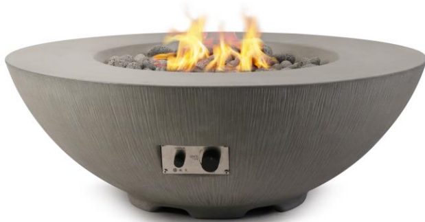
Slate grey shown above with Optional Aluminum Legs SH-SL-NG/LP