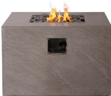
Slate Grey shown above CA-SL-NG/LP