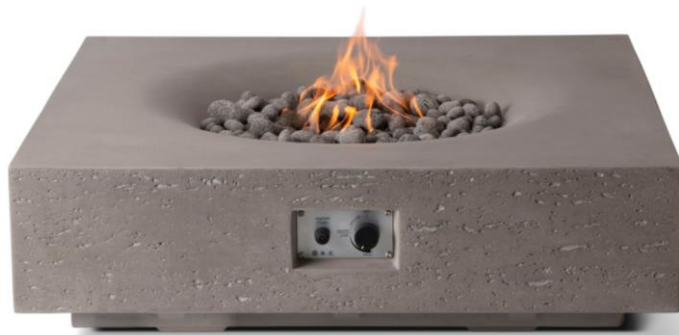
Slate Grey shown above IN-SL-NG/LP