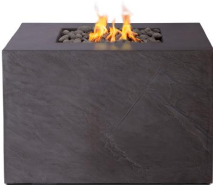
Charcoal Grey shown above CA-CH-NG/LP

Caballo is inspired by mid century modern design and includes authentic Bali beach rock for a sophisticated style.