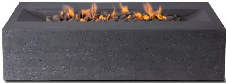
Charcoal Grey shown above MI-CH-NG/LP

Millenia is inspired by mid century modern design and includes authentic Bali beach rock for a sophisticated style.