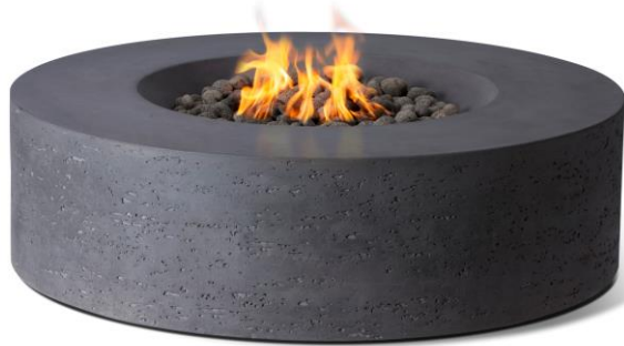
Charcoal Grey shown above GE-CH-NG/LP

Genesis is inspired by mid century modern design and includes authentic Bali beach rock for a sophisticated style.