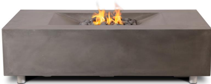
Slate Grey shown with Optional 3" Aluminum Legs above MO-SL-NG/LP