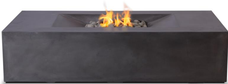
Charcoal Grey shown above MO-CH-NG/LP