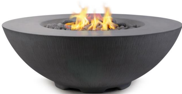
Charcoal Grey shown above SH-CH-NG/LP

Shangri-la is inspired by mid century modern design and includes authentic Bali beach rock for a sophisticated style.