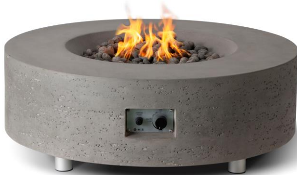
Slate Grey shown above with Optional Aluminum Legs GE-SL-NG/LP