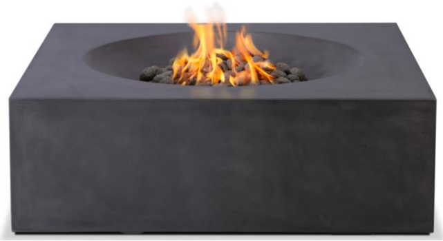
Charcoal Grey shown above TA-CH-NG/LP