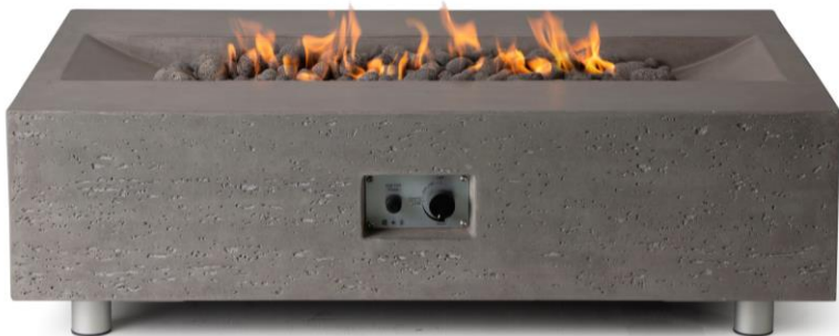
Slate Grey shown above with Optional Aluminum Legs MI-SL-NG/LP