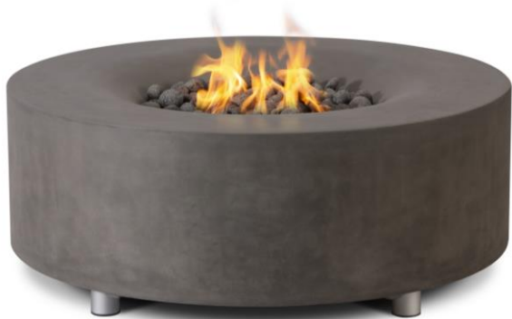
Slate Grey shown above with Optional Aluminum Legs AV-SL-NG/LP