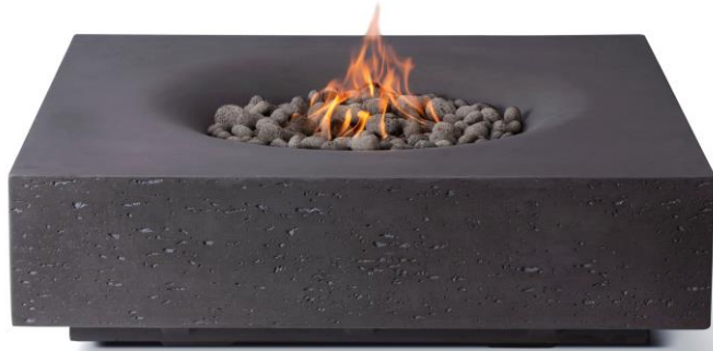
Charcoal Grey shown above IN-CH-NG/LP

Infinity is inspired by mid century modern design and includes authentic Bali beach rock for a sophisticated style.